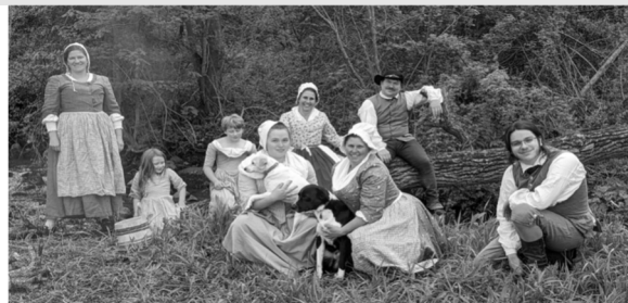
Living History Day at the Museum reimagines life 250 years ago. Join us on September 14th 9:30—4:00.