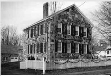
"THE STONE HOUSE MUSEUM"

Belchertown Historical Association Belchertown, Massachusetts 1903—2024