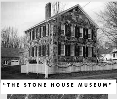
"THE STONE HOUSE MUSEUM"

Belchertown Historical Association Belchertown, Massachusetts 1903—2020