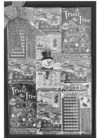
Scratch-ticket Yuletide Raffle $2 each, 3 for $5 We are hoping very much that proceeds from this event will help balance our annual operating budget.

Our Yuletide event (November 3) is one of our most important fundraisers and will conclude with our scratch ticket raffle drawing. Equally as important, it is a great time to come visit and renew friendships at the beginning of the New England Holiday season. We need EVERYONE’S help to fill our rooms and tables with crafts, baked goods and raffle baskets or items. We know that some of you excel at baking, knitting, sewing, and crafts. For those of you that excel at shopping, you can join the fun by looking for items around a theme (winter, cooking, reading, decorating...) and put together a few items that will make a fun basket for our raffle room. The Stone House will be open for you to bring in your donations on Sunday, October 28 from 12:00—2:00 and Friday, November 2 from 4:00-6:00. We look forward to seeing what surprises you have for us this year. If you can volunteer for a shift at the event, please call me at 413-949-0970 . Again this year we will feature a limited, high-end version of our “Old Bag” sale in the Silent Auction room.