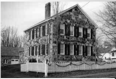
"THE STONE HOUSE MUSEUM"

Belchertown Historical Association Belchertown, Massachusetts 1903—2018