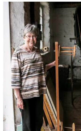
If you know what this wooden object is and how it was used, call Tom!