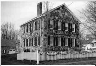
"THE STONE HOUSE MUSEUM"

Belchertown Historical Association Belchertown, Massachusetts 1903—2018