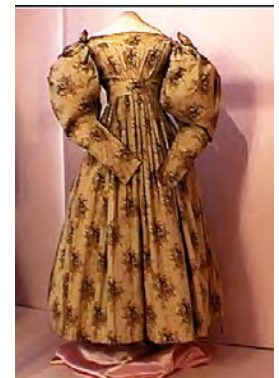
A Civil War era wedding dress