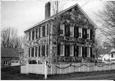
"THE STONE HOUSE MUSEUM"

Belchertown Historical Association Belchertown, Massachusetts 1903—2014