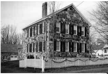
"THE STONE HOUSE MUSEUM"

Belchertown Historical Association Belchertown, Massachusetts 1903—2008