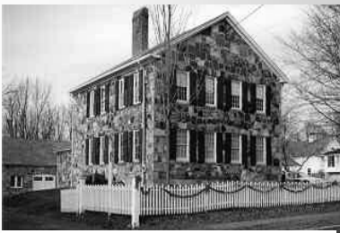
"THE STONE HOUSE MUSEUM"

Belchertown Historical Association Belchertown, Massachusetts 1903—2010