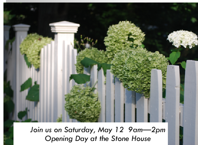
Join us on Saturday, May 12 9am—2pm Opening Day at the Stone House

In the Stone House, work has been completed toward replacing our climate control system. We were awarded two Community Preservation Grants at 2009's town meeting. We waited to actually receive the funds before commencing work. We will now begin work on the second grant, addressing certain structural issues inside the museum